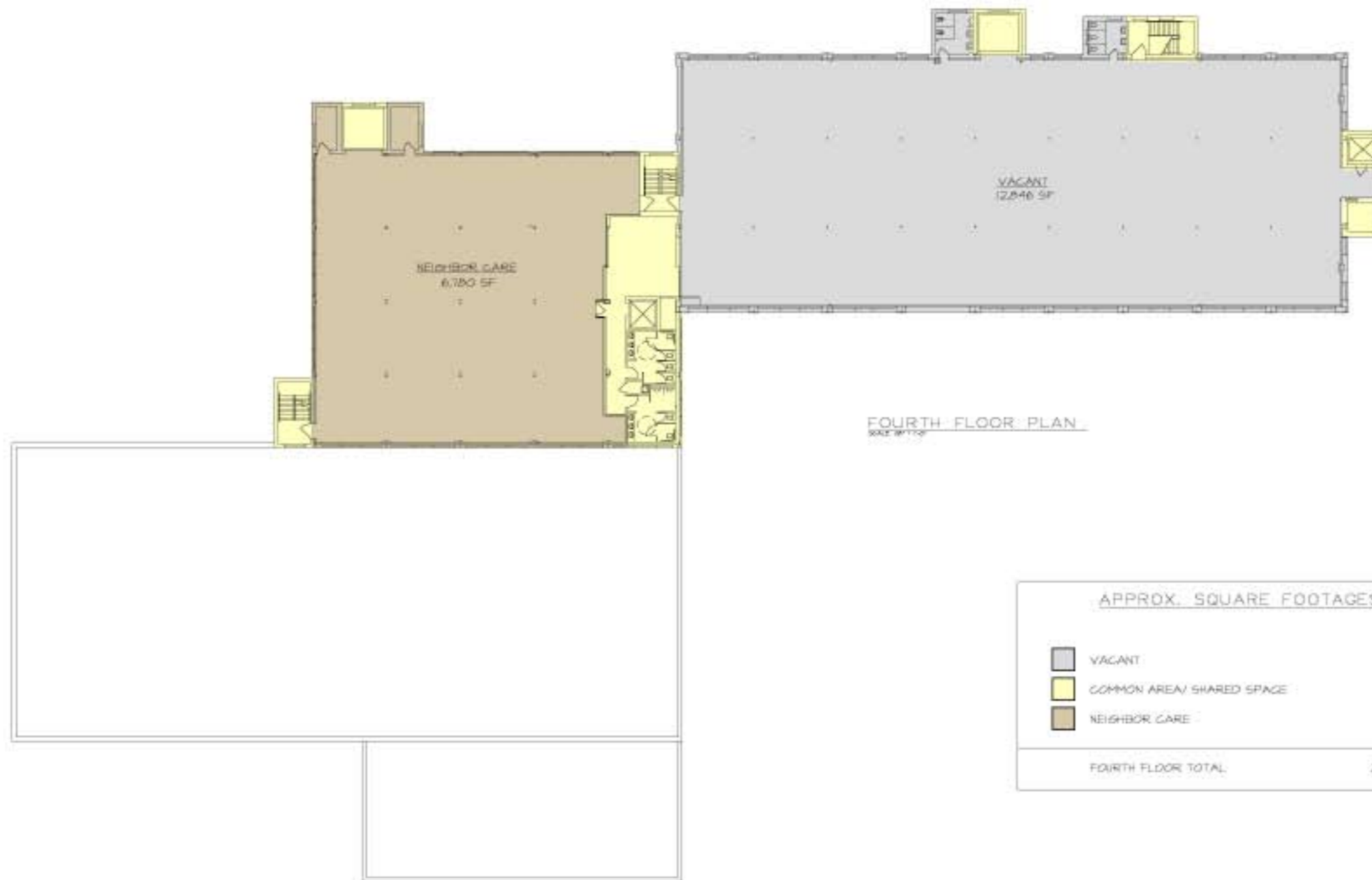
FOURTH FLOOR PLAN SCALE 1/8" = 1'-0"