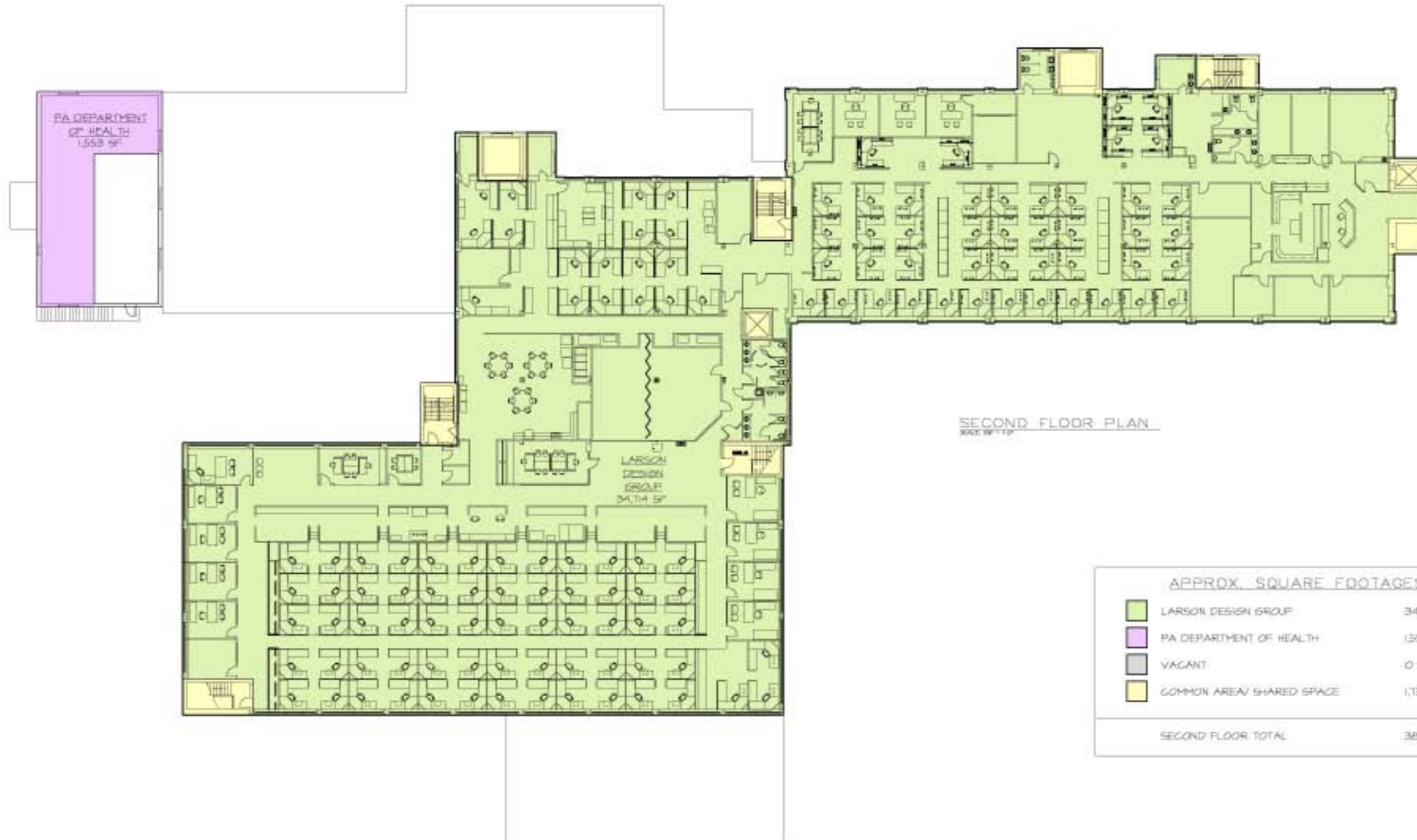
SECOND FLOOR PLAN SCALE 1/8" = 1'-0"